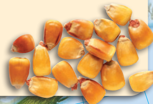
Kernels of maize