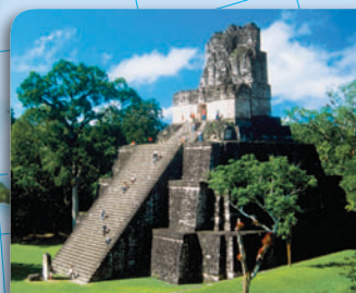
Maya pyramid, Tikal, Guatemala