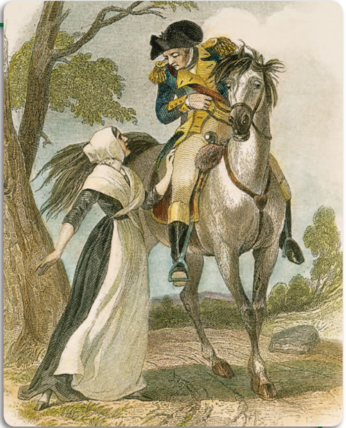
A female spy passes news to a colonial officer.

“Born for liberty, disdaining to bear the irons of a tyrannic Government , we associate ourselves . . . [with those rulers] who have extended the empire of liberty, and contented to reign by sweetness and justice, have broken the chains of slavery, forged by tyrants.”