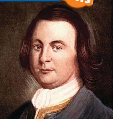
George Mason Antifederalist