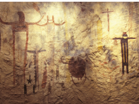
Rock art from Seminole Canyon State Park

Some artifacts had clear uses. Arrowheads, for example, were used for hunting and fighting. Axes and choppers were handy tools. Other artifacts are not so easy to understand. In parts of Texas, including the Pecos River valley, Seminole Canyon, and Big Bend, scholars have found images painted onto or carved into stone. These images often show important events, such as hunts or wars. Some use vividly colored paints