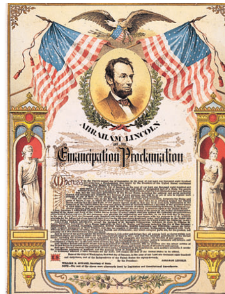
The Emancipation Proclamation freed all slaves in areas “in rebellion against the United States.”

Reading Check Summarizing How did the Civil War affect the Texas economy?