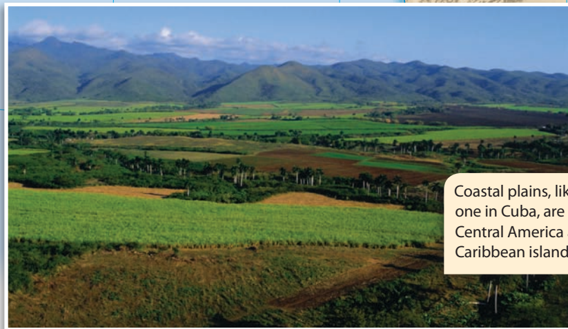
Coastal plains, like this one in Cuba, are found in Central America and the Caribbean islands.