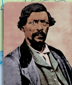
Jim Beckwourth was an African American fur trapper and explorer of the West in the early 1800s.

Beckwourth survived many hardships during their search for wealth and adventure. To survive on the frontier, mountain men adopted Native American customs and clothing. In addition, they often married Native American women. The Indian wives of trappers often worked hard to contribute to their success.