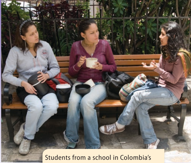
Students from a school in Colombia's capital, Bogotá, take a break from their classes.