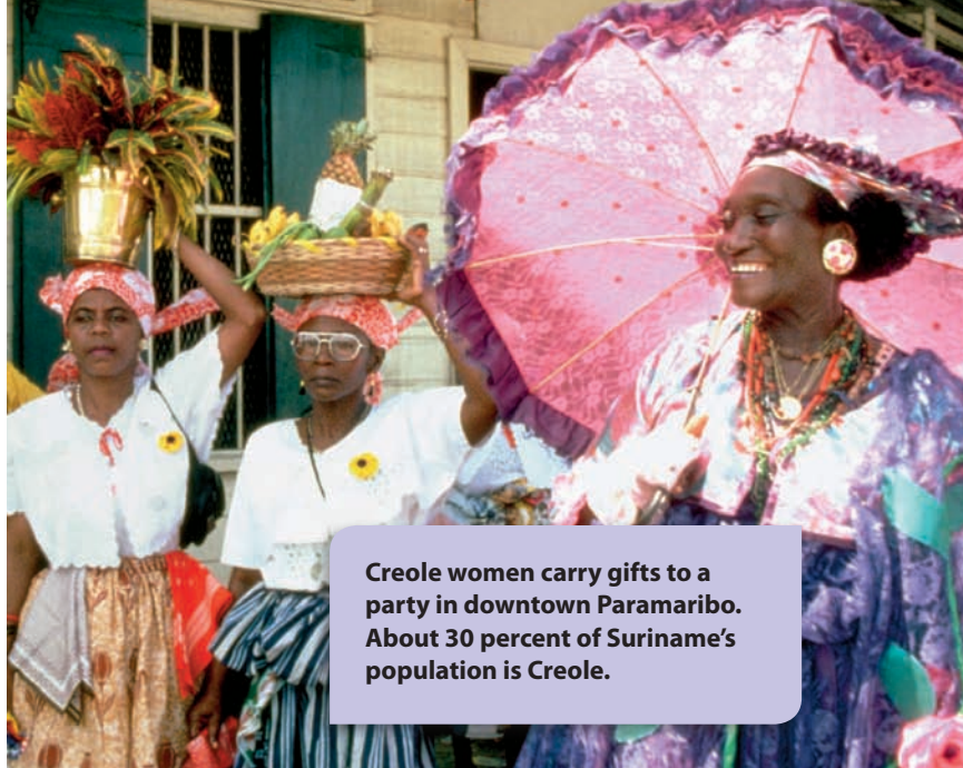
Creole women carry gifts to a party in downtown Paramaribo. About 30 percent of Suriname's population is Creole.

READING CHECK Contrasting How is French Guiana different from the rest of the Guianas?