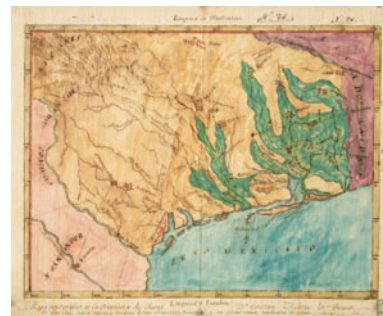
Stephen F. Austin created this map of his colony in 1833.

Reading Check Identifying Cause and Effect Why did Stephen F. Austin travel to Mexico, and what was the outcome of his trip?