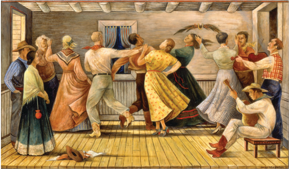
For entertainment, Texans gathered at local dances.