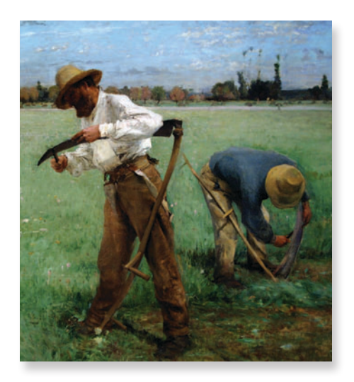
Texas settlers established small farms across the frontier.