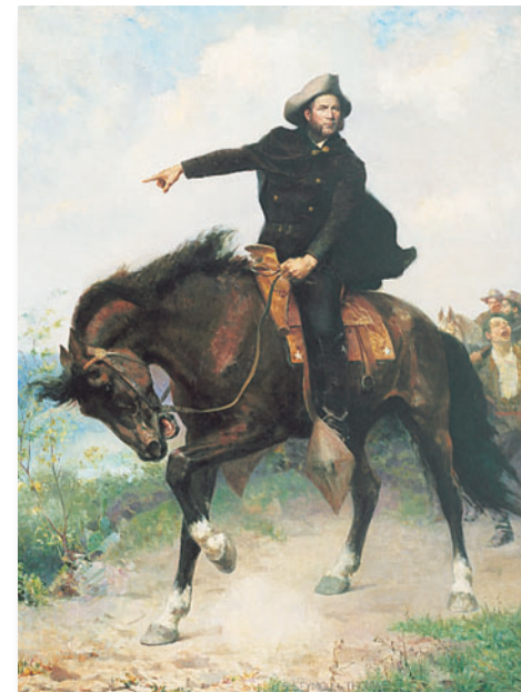
Sam Houston was considered a hero after the Battle of San Jacinto.

Santa Anna had disappeared during the battle. He was found the next day hiding in the marsh and taken prisoner. When the captured Santa Anna wrote his second-in-command to withdraw, the bulk of the Mexican army stopped fighting. The Texas army won not only the Battle of San Jacinto but also the war. Houston refused to let the soldiers kill the defeated Mexican general. He later explained his reasons.