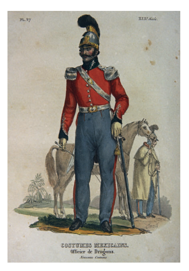
The Mexican government sent additional troops to Texas to enforce the Law of April 6, 1830.